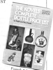
Fourth Edition (Issued every other year)

Do you have a friend who might like our newsletter? Why not send us their name and address and let us send them a free, introductory copy?