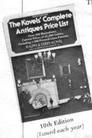
10th Edition (Issued each year)

Over 11,000 current prices—more than any other price guide. With more than 400 illustrations in color and black-and-white, THE KOVELS' COMPLETE BOTTLE PRICE LIST is the definitive listing of current bottle prices. It far surpasses, both in quality and quantity of listings, anything now on the market. Includes the record-breaking prices for the Charles B. Gardner Collection and some of their resale value. $7.95